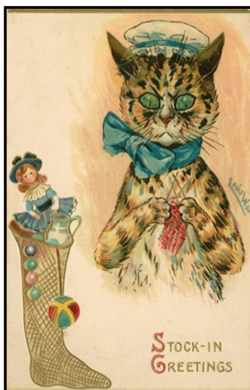
Louis Wain’s cat. Christmas cardcard-Est value £20,000

Keep a close eye out for an announcement on this subject and come along to our January meeting to find out more. ED