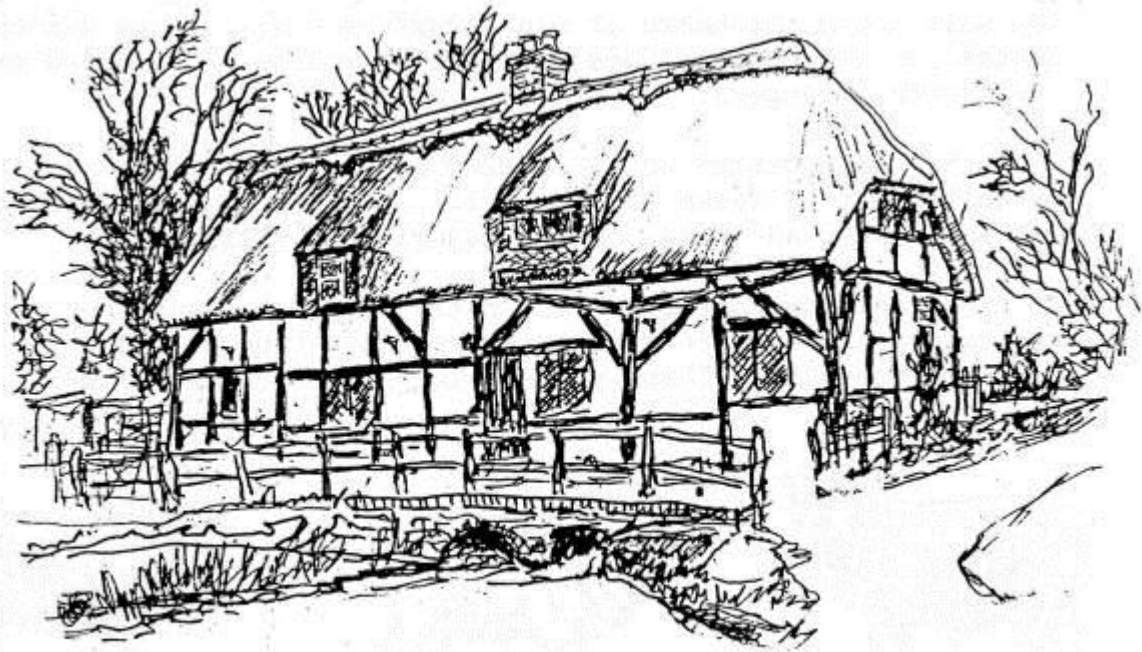
Fulling Mill. c1860.